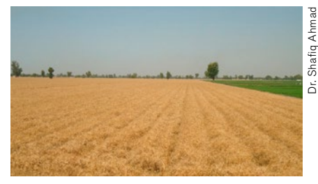
Intercropping: Wheat planted into cotton fields; last irrigation flow for cotton serves as initial irrigation for following wheat.