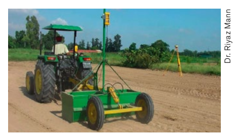
Laser levelling reduces water losses due to uneven fields; application needed only every 5–10 years.