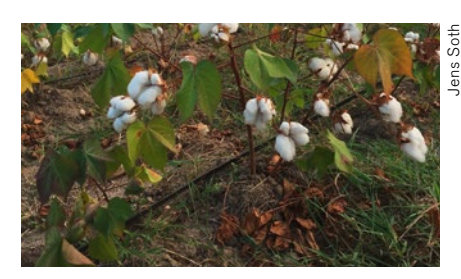
Soil cover or mulching: Depending on soil quality and coverage, water use can be reduced by 15–30%