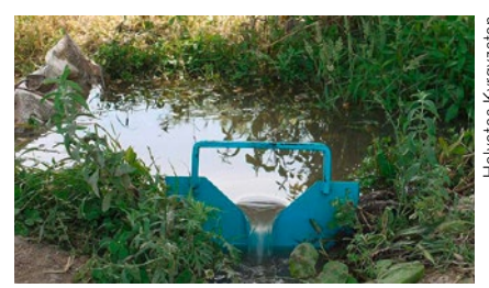
Water measuring: Increasing water productivity requires adequate monitoring and controlling. The Triangular weir is a simple, reliable tool applicable by individual farmers.