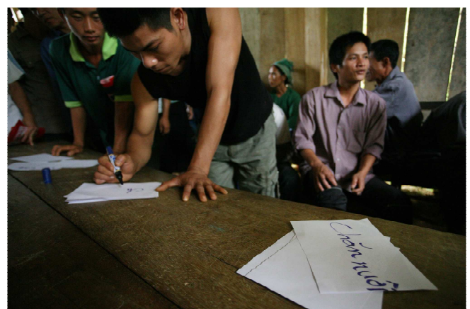
Farmers during a local planning meeting in Quang Lam commune, Bao Lam district, Cao Bang Province

The difference in representation by different ethnic groups diminished. In 2007 at least 41% of the lowland living ethnic Tay and Nung farmers stated their participation in local planning meetings which was double in 2009. Within the group of Dzao and Hmong in 2007 participation was with 2% next to nothing, however over the past years it jumped up to 67% of households of upland living ethnic minorities stating participation in local planning meetings.