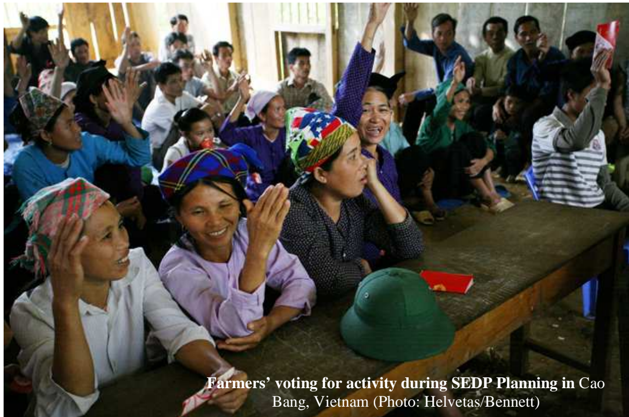
Farmers' voting for activity during SEDP Planning in Cao Bang, Vietnam