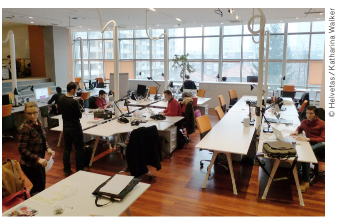
Shared office space located within HUB387.

MarketMakers used these constraints as an entry point and chose HUB387, an IT Hub, and BIT Alliance, an industry association, as its first two interventions by providing support such as business planning or small seed money.