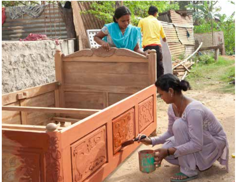
Trainee carpenters: Two young women of the Tharu ethnic minority in Nepal learn new skills

This is usually not a concern for trades with