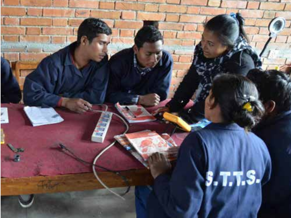
Trainee electricians: A woman trainer in Nepal explains the concept of electrical circuits.

Swiss Agency for Development and Cooperation SDC