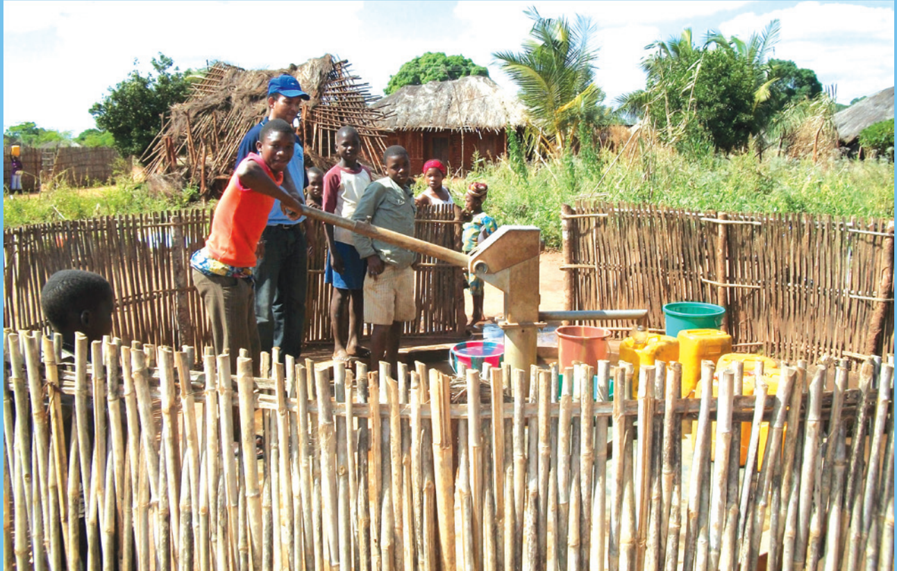
Participatory planning is key to increase the level of water supply and sanitation coverage

In Mozambique, the water sector is marked by several challenges related to the planning and budgeting. This is one of the findings of the study on “Analysis of investments for the water and sanitation sector at the level of districts of Nacarôa (Nampula) and Chiúre (Cabo Delgado)”, carried out by the Institute of Social and Economic Studies (IESE). And according to the study, the investment for water and sanitation sector has a significant decrease, in recent years, this fact affected the amount of resources allocated to the districts.