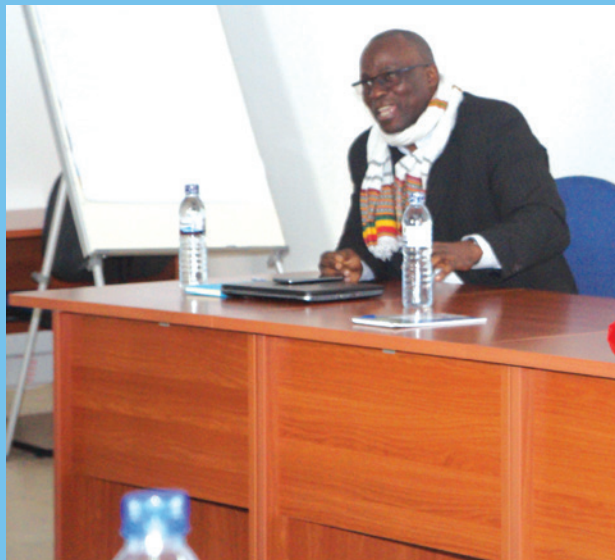
By Artur Matavele

The most common model for national citizen participation in the management of water supply systems is through water committees in rural areas. In urban areas, although there is a Water Regulatory Board, and the citizen participation is still unclear. Water committees in rural areas have inconsistencies in terms of capacity, competence and practice. Probably, the fact that most water supply projects and resources have external financing, through different agents, with different approaches, is likely to weaken the implementation of what is established in the legislation. Water committees do not always understand the long-term nature they should have, which means that when there are withdrawals in a group, or a member gives up, for example, there are hardly any replacements for those leaving, and sometimes the lack of internal governance mechanisms of the committees (transparency