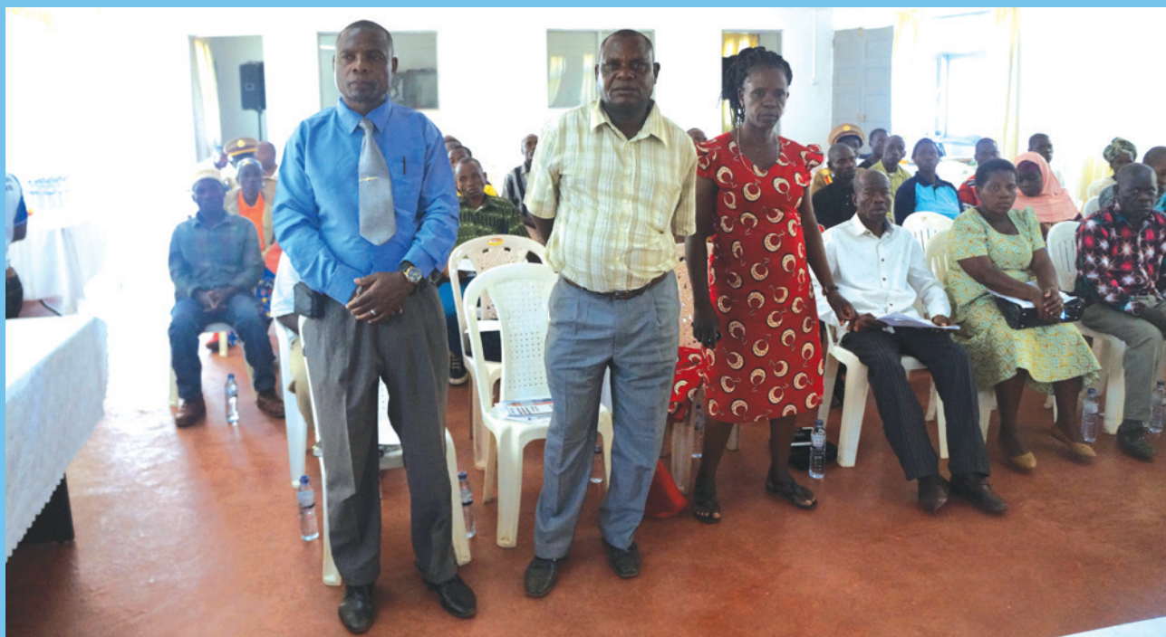
Lago ODASS demanded community leaders to promote good practices in their respective areas