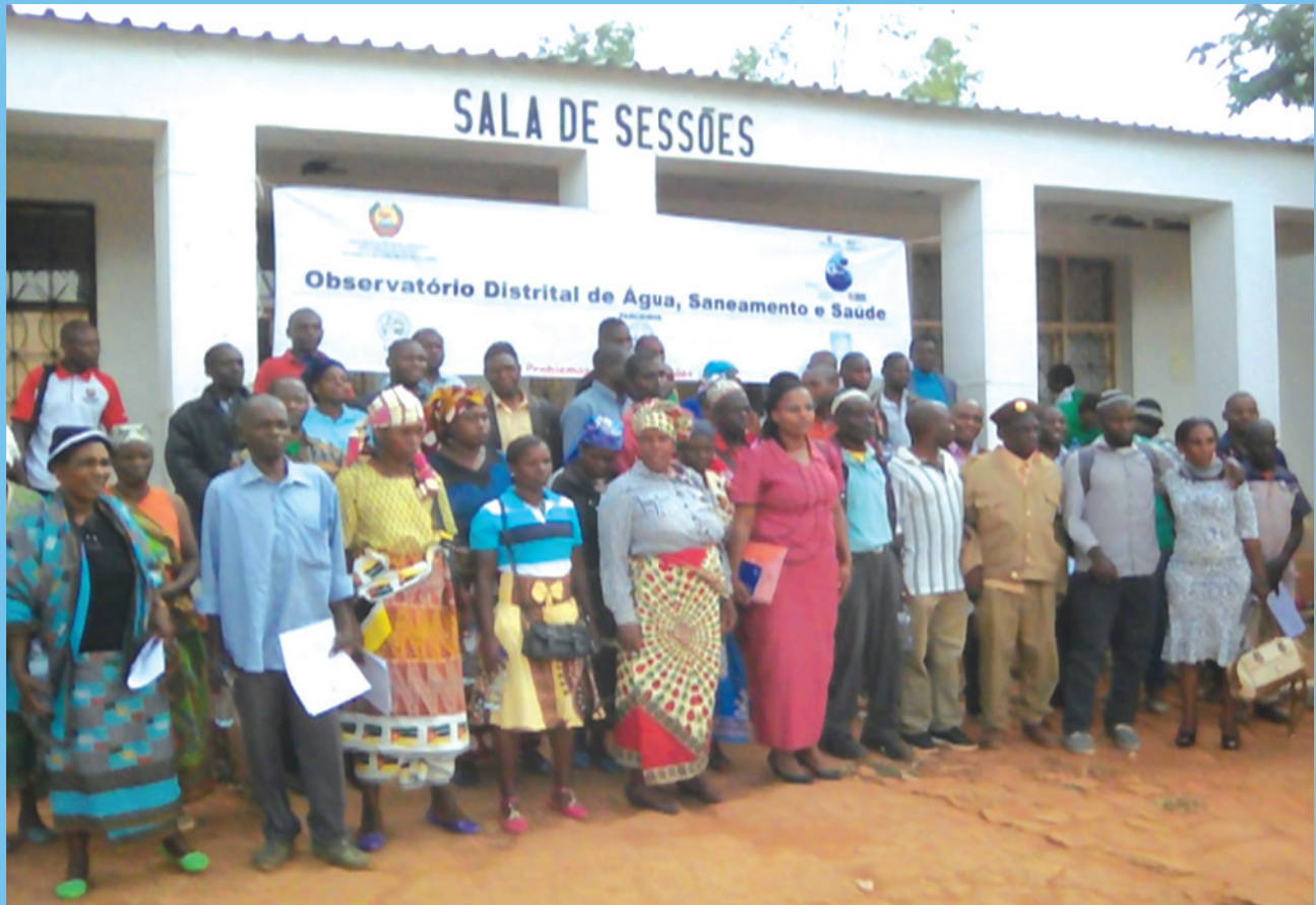
Chimbunila ODASS Participants

The district Observatory for Water, Sanitation and Health (ODASS) is an interesting experience brought by the Transparent Governance Programme for Water, Sanitation and Health (GoTAS), which is being implemented in the province of Niassa, particularly in the districts where the programme is being implemented, namely Sanga, Lago and Chimbunila. It is an important tool in the context of good governance, since there are government representatives from the district level to the locality level, including representatives of the civil society organizations and of the community, which facilitates the implementation of three of the four pillars that the Global Water Integrity Outlook