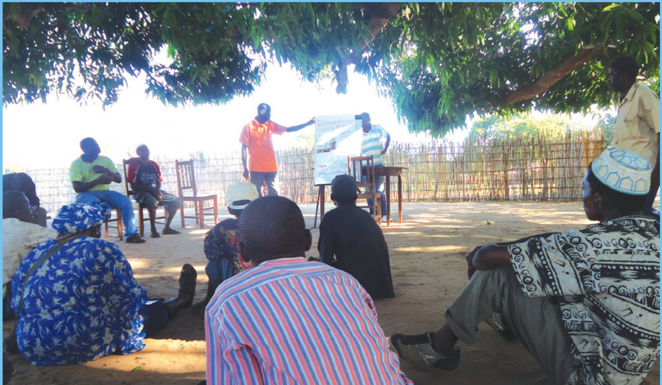
Advocacy Session in Macomia District