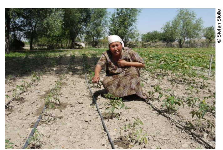
Drip irrigation system in Batken, Kyrgyzstan

Applying drip irrigation in special cases has decreased irrigation water volume by 2.5 to 6 times and labour cost by 6 to 8 times, through reducing work load. Twice less fertilizer is used and the efficiency increased because of local and direct application to the plants. The gain in efficiency also benefits soils and groundwater quality. General decrease in air and soil humidity lessens the diseases and weeds damaging the crops. Regulated input of fertilizers and water doubled the crop yield. In 2009, 400 farmers were introduced to drip irrigation in Kyrgyzstan.