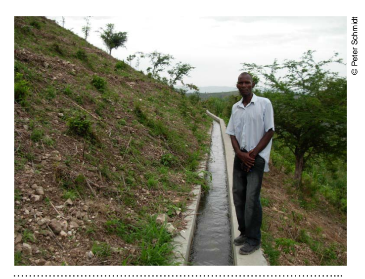
Watershed management and water control in Haiti

Small canals have been renovated to better control water and improve irrigation efficiency in combination with anti-erosion measures and capacity building for water users. The issue of food production is combined with income generation perspectives and measures to increase resilience.