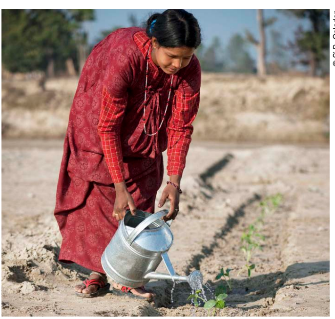
Riverbed farming during the dry season in southern Nepal

In Nepal, 20% of the people are land-less or land-poor. Helvetas supports institutional and technical arrangements enabling over 3000 landless families to cultivate crops in dry riverbeds resulting in an annual additional family income of 500 USD. The possibilities for expending this experience may allow up to 500'000 people to benefit from unused arable land and generate income to escape extreme poverty.