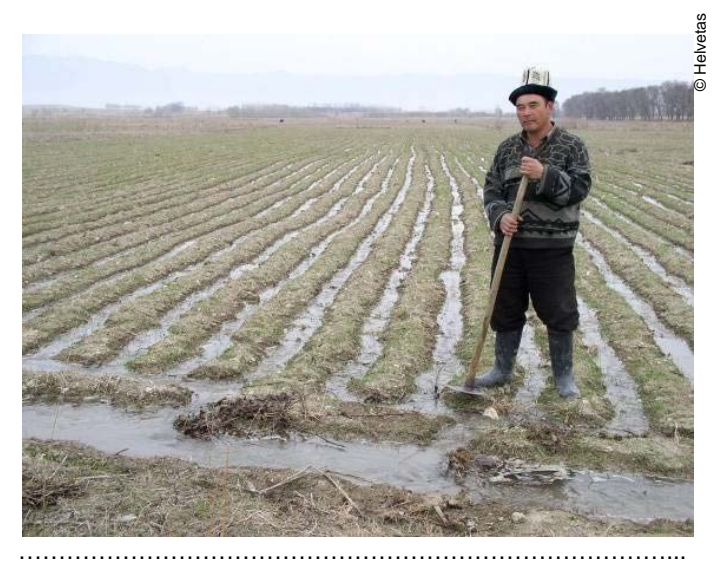
Traditional furrow irrigation in Kyrgyzstan

Unequal water allocation and overuse have lead to water shortage because of old and deficient channel irrigation techniques remaining from the former Soviet Union. Helvetas supports innovative water saving techniques and intervention approaches which contribute to more efficient water use.